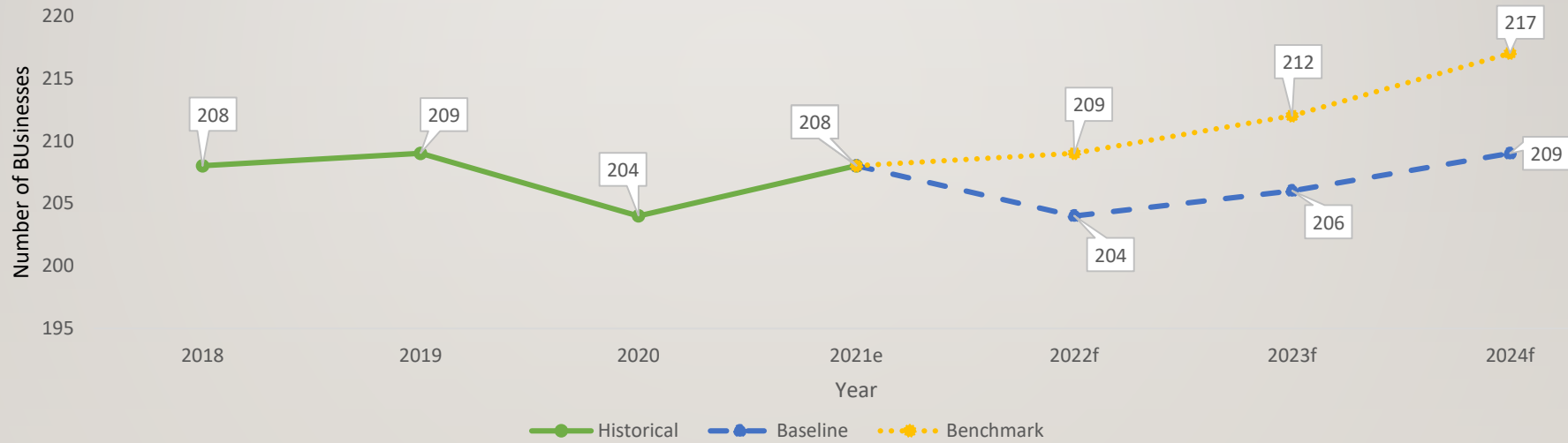
Number of Businesses in the Rotterdam Section of the SCSD with Historical, Projected Baseline and Projected Benchmark